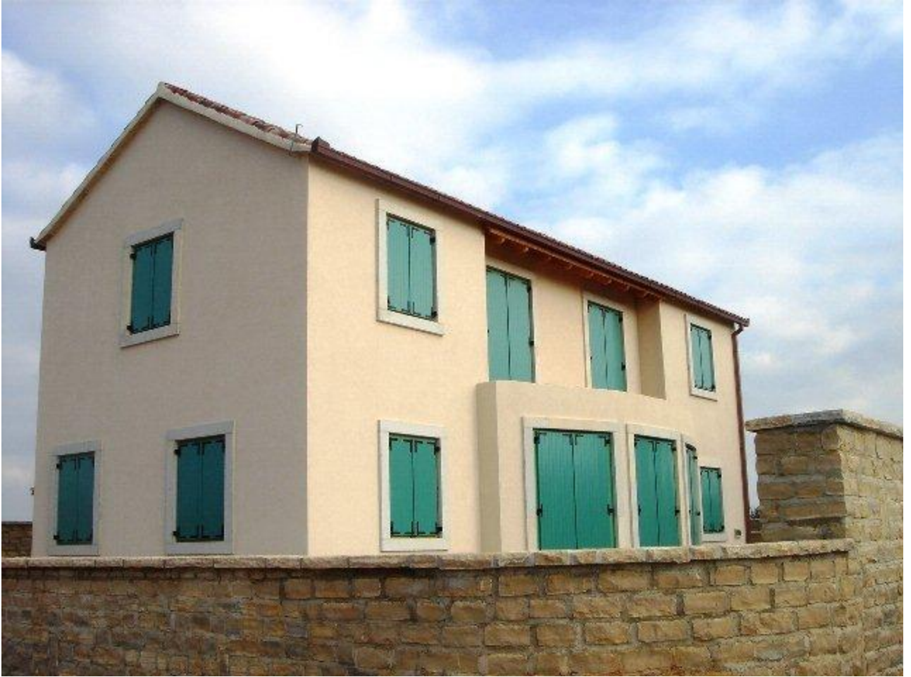
THE VIEW FROM THE VILLA