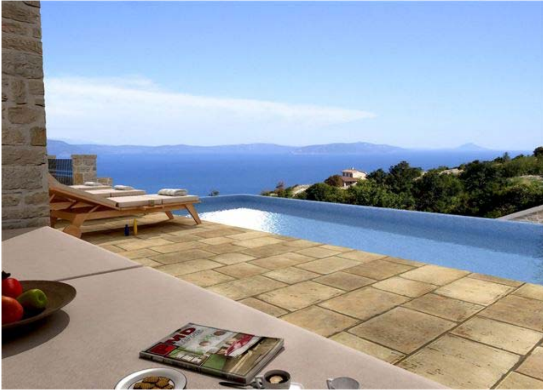
THE BEACH NEAR VILLAS ....